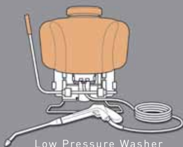
Low Pressure Washer