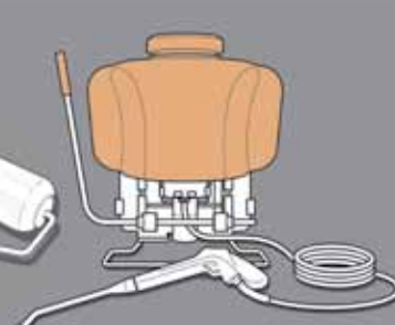
Low Pressure Washer